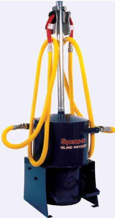
Shown with optional vacuum accessories - hoses, tools and tool hangers.

Protect your vacuum system and your revenue with an Island Knockout Separator, specially designed for auto cleaning operations.