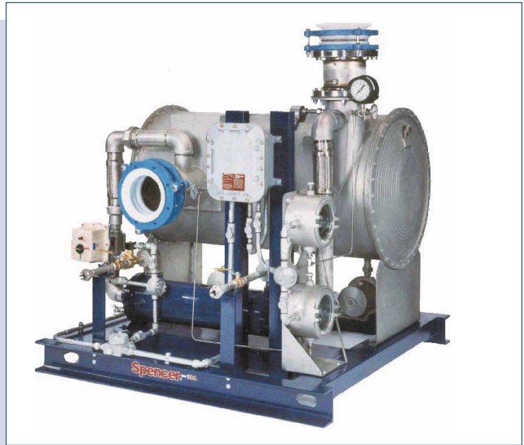
Spencer digester gas booster skid package using anaerobic digester gas (ADG) at a fuel cell application in New York State funded by the Environmental Protection Agency.