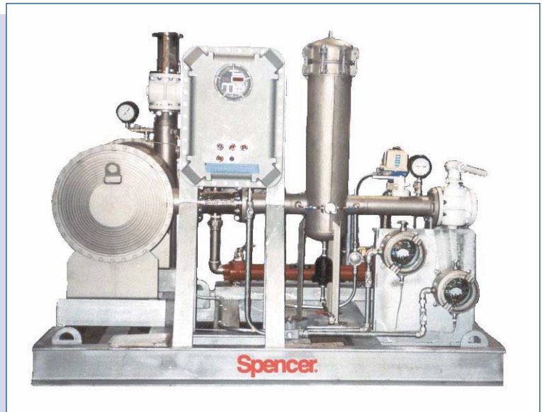
Digester gas booster system in Washington State has all-stainless-steel components plus an integral moisture separator to deliver drier fuel.